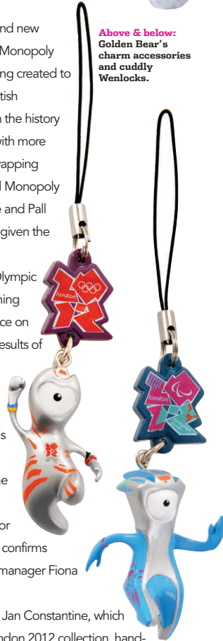
Above & below: Golden Bear's charm accessories and cuddly Wenlocks.