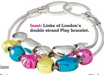
Inset: Links of London's double strand Play bracelet.

WWRD too, has a large range of London 2012 product launching under the Johnson Brothers, Royal Doulton, Wedgwood and Waterford brands. Items range from a Johnson Brothers porcelain mug at £4 from Royal